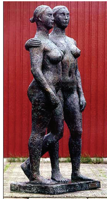
Women from Tórshavn, 1992